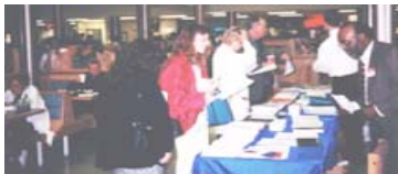
VA Medical Center Federal Employees

In 1998 the FEA started providing: "A means for individuals to calculate their estimated retirement savings needs, based on their retirement income goal as a percentage of their pre-retirement income;"